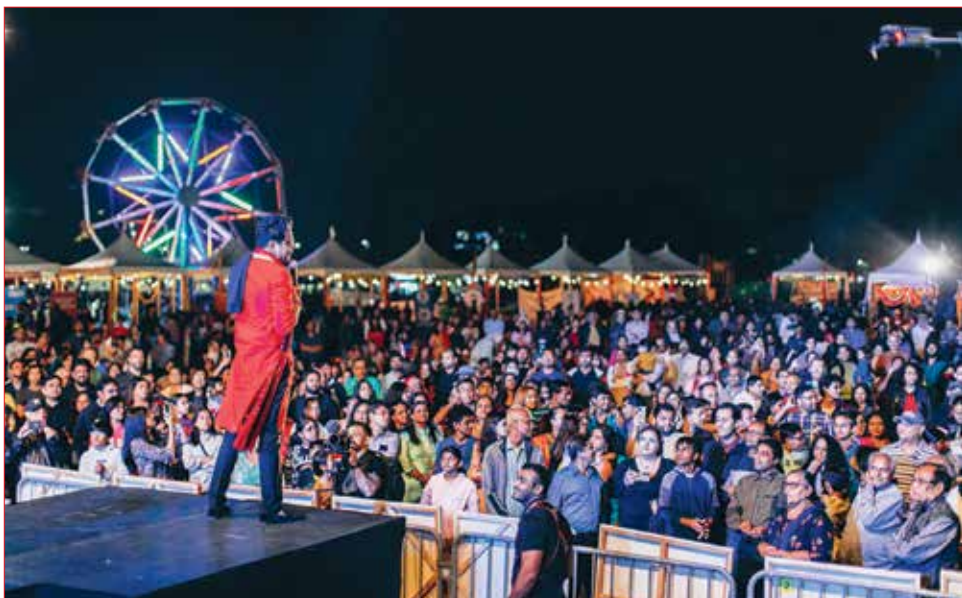
Thousands celebrated Diwali @ Masala Radio's HOUSTON DIWALI MELA last Saturday. In a freak coincidence, it turned into a double celebration as midway through the event the Houston Astros won the World Series!